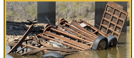
This trailer was in the Kansas River for years. We removed it during our inaugural 15-mile One Kansas City River Cleanup in September.