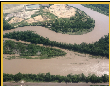
Flood of 2015 and its impact on the Kansas River, threatening erosion, sedimentation, and contamination.

Climate change is impacting multiple facets of modern life largely due to connections to the changing water cycle. Climate change significantly and negatively impacts the Kansas River and has created a crisis for the river, the broader ecosystem, and river users. Friends of the Kaw recognizes the need to engage in advocacy and education relating to the climate crisis.